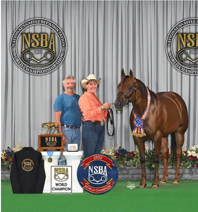
"Simply Statutory" NSBA World Champion